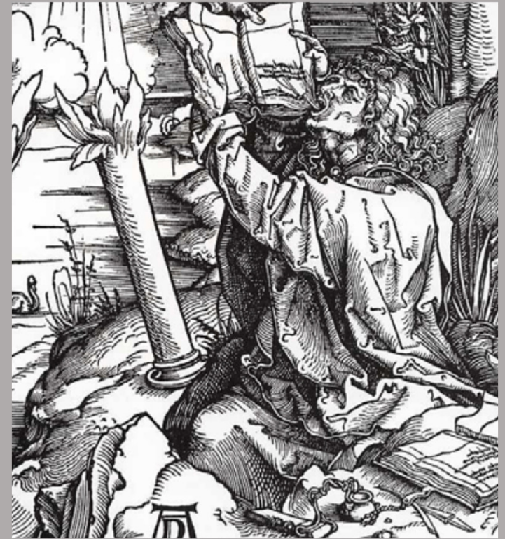
Reference: Dürer's illustration

The vision is symbolic of the nature and influence of the Protestant Reformation, centred around a book.