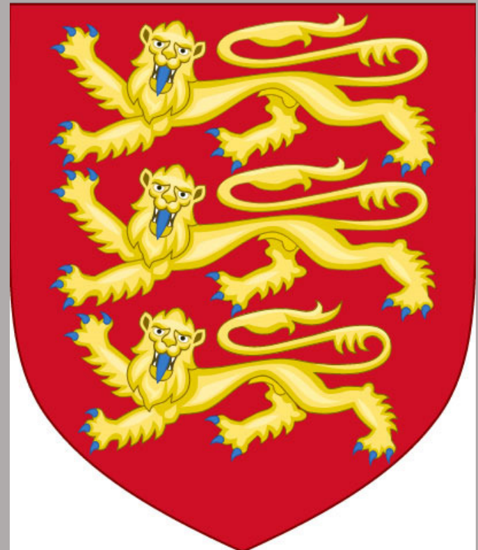
Royal Arms of England

Symbolic of the English as a pre-eminent language. The coat of arms of England is three lions walking and guarding.